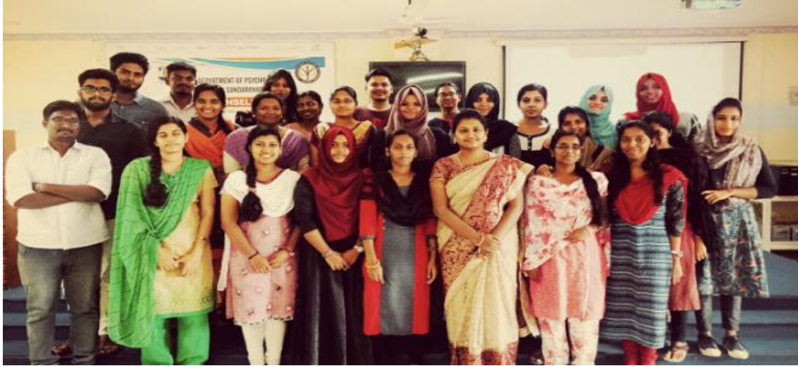
At M.S. University -‘Opportunities Issues And Strategies In Counselling’ on 7.8.18